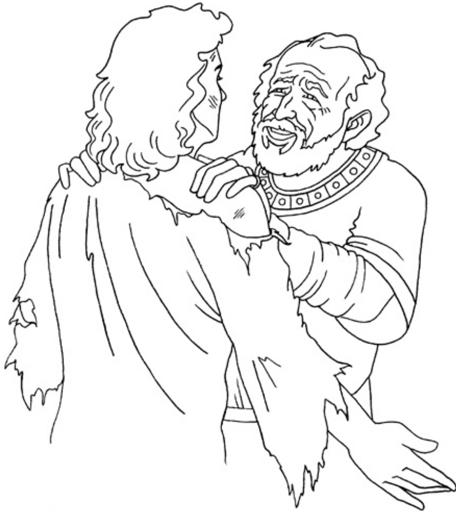
Jesus told the parable of the prodigal son. Luke 15:11-32